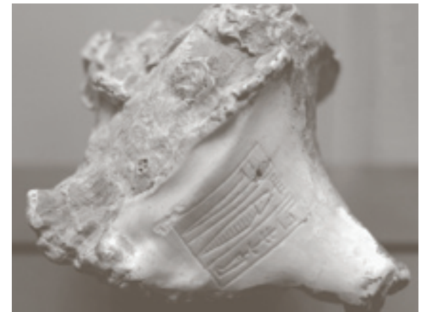
A 4000-year-old Murex sea snail shell inscribed with the name of a king of Kish, an island in the Persian Gulf probably populated by the Cultivators. The snail was a source of purple dye for royal robes.

You belong to the Cultivators, haplogroup J, who are about 20,000 years old. Your ancient ancestors most likely lived in the southern and northern parts of