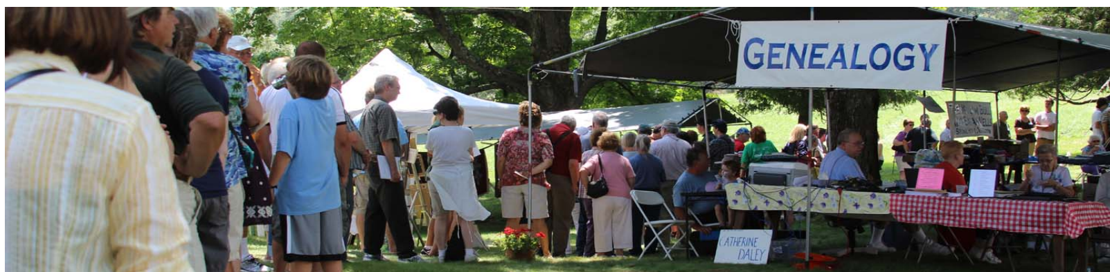
Genealogy Tent at the 2012 Annual Bull Picnic.