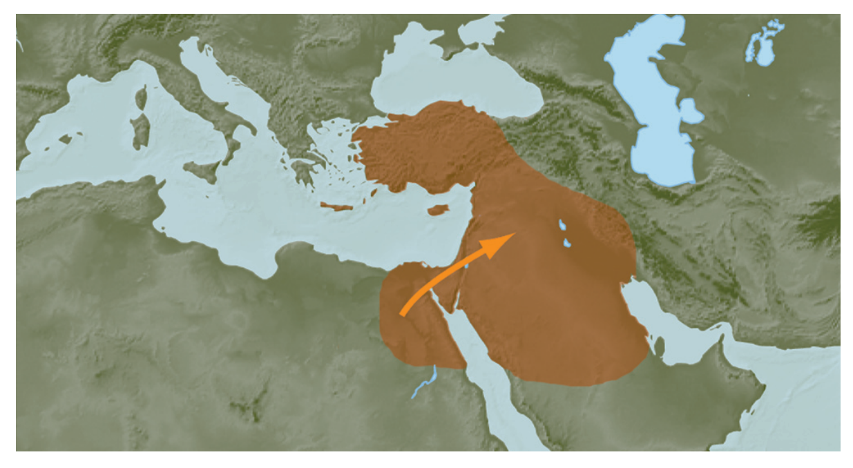
Your ancient ancestors likely traveled this path—settling for various periods of time at points along the way.

the Fertile Crescent, where you'll find present day Egypt, Saudi Arabia, Syria and Iraq.