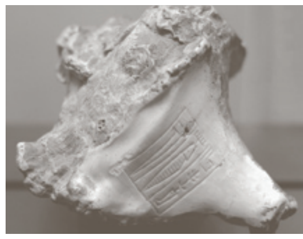
A 4000-year-old Murex sea snail shell inscribed with the name of a king of Kish, an island in the Persian Gulf probably populated by the Cultivators. The snail was a source of purple die for royal robes.

You belong to the Cultivators, haplogroup J , who are about 20,000 years old. Your ancient ancestors most likely lived in the southern and northern parts of