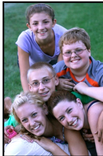
A heap of Bull cousins, Bull Picnic 2010

Please send your e-mail address along with your name and postal address to Judy Wood via e-mail at bullfamilygenealogist@verizon.net , by U.S. mail at 5505 Frost Lane, Flower Mound, TX 75028 or by phone at (972)539-4215. We need to keep the herd informed.